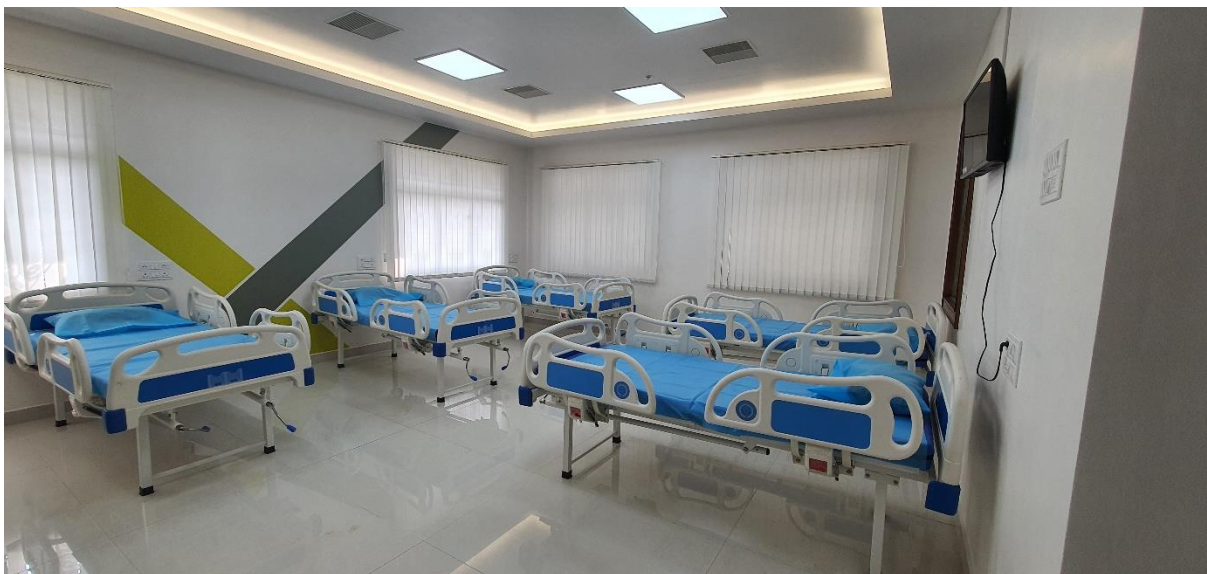
Patient observation room