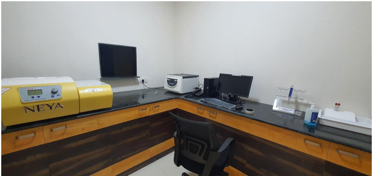
Sample processing Laboratory