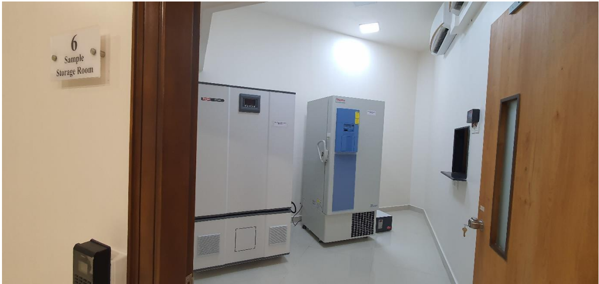
Sample storage room