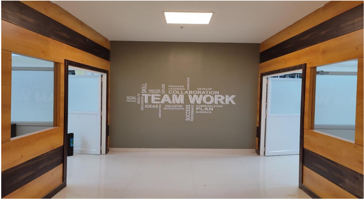
Our belief – team work